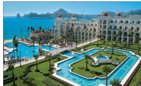
Riu Palace Cabo San Lucas

The Mar de Cortés Grill & Steakhouse and El Médano feature Hot & Cold Buffets with “on the spot” cooking stations featuring seafood, chicken, varied meats and more. Pizza, pasta, soups and lavish salad bars.