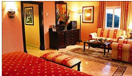
Junior suites are also available.